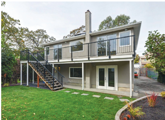
Updating an older home can include everything up to a complete rebuild if the clients desires

"My carpenters do all the finishing, framing, enveloping and demolition and I then employ